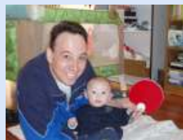
Jordan, 4 months old